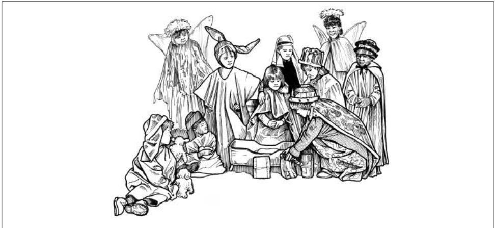
This picture shows a scene from a Nativity play.