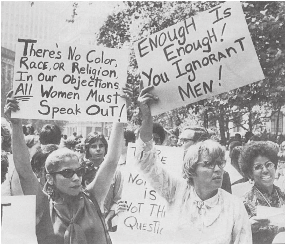
Women marching and protesting on the streets of New York City, 1968.