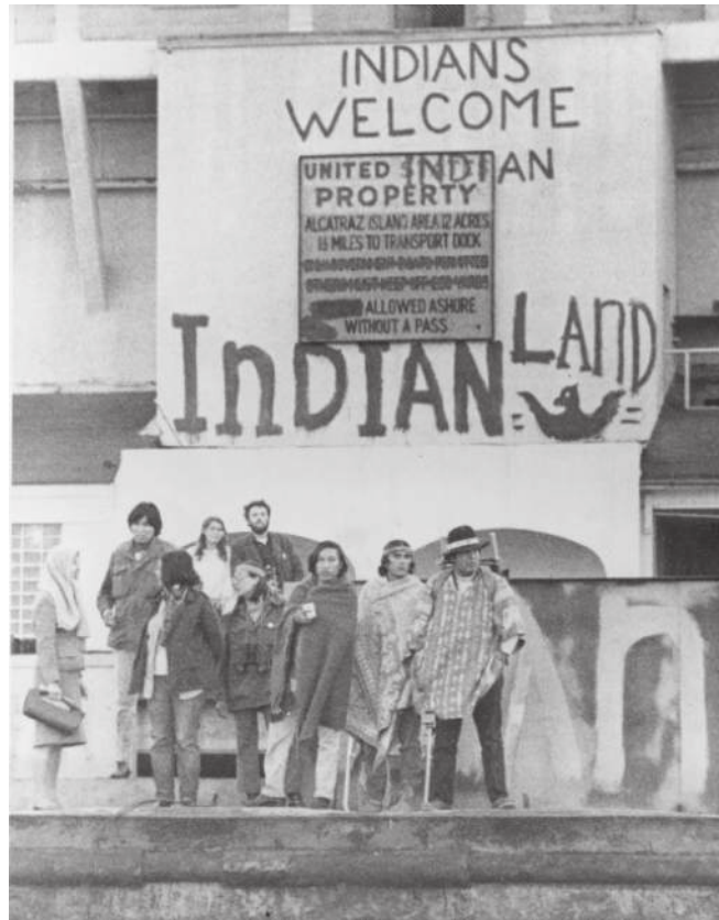
A photograph showing some of a large group of Native Americans who landed on Alcatraz on November 20, 1969, and claimed it for the Indian nation.