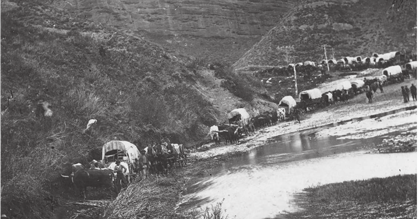
Emigrants in a wagon train struggling through muddy conditions in Echo Canyon, Utah, as they traveled along the California Trail in 1866.