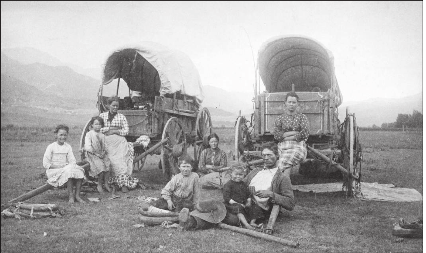
An emigrant family photographed by their wagons as they traveled along the Oregon Trail in the late 1860s.