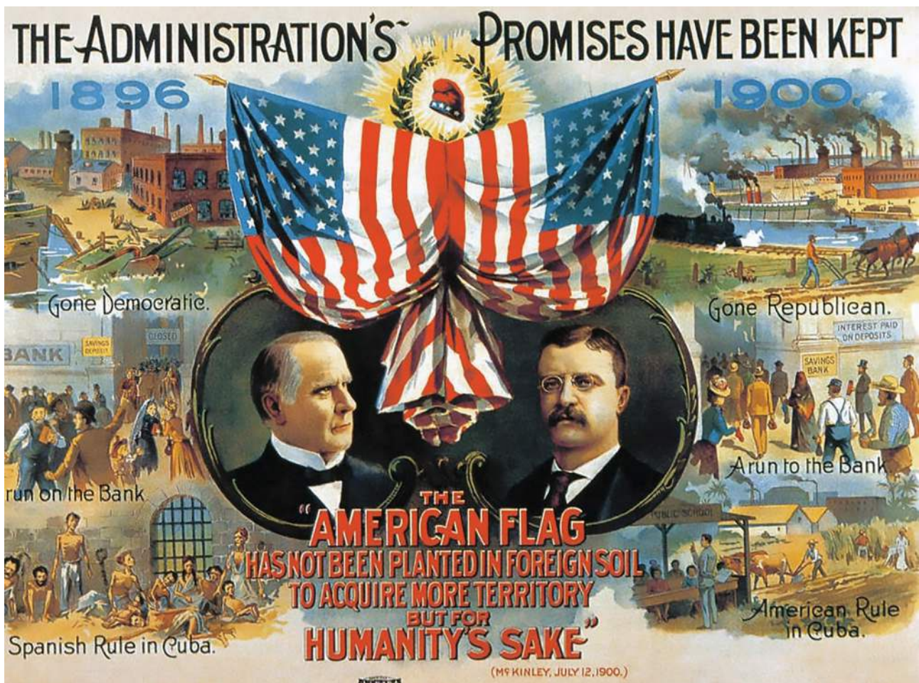
The McKinley–Roosevelt campaign poster from 1900 showing the effects of the Spanish American War.