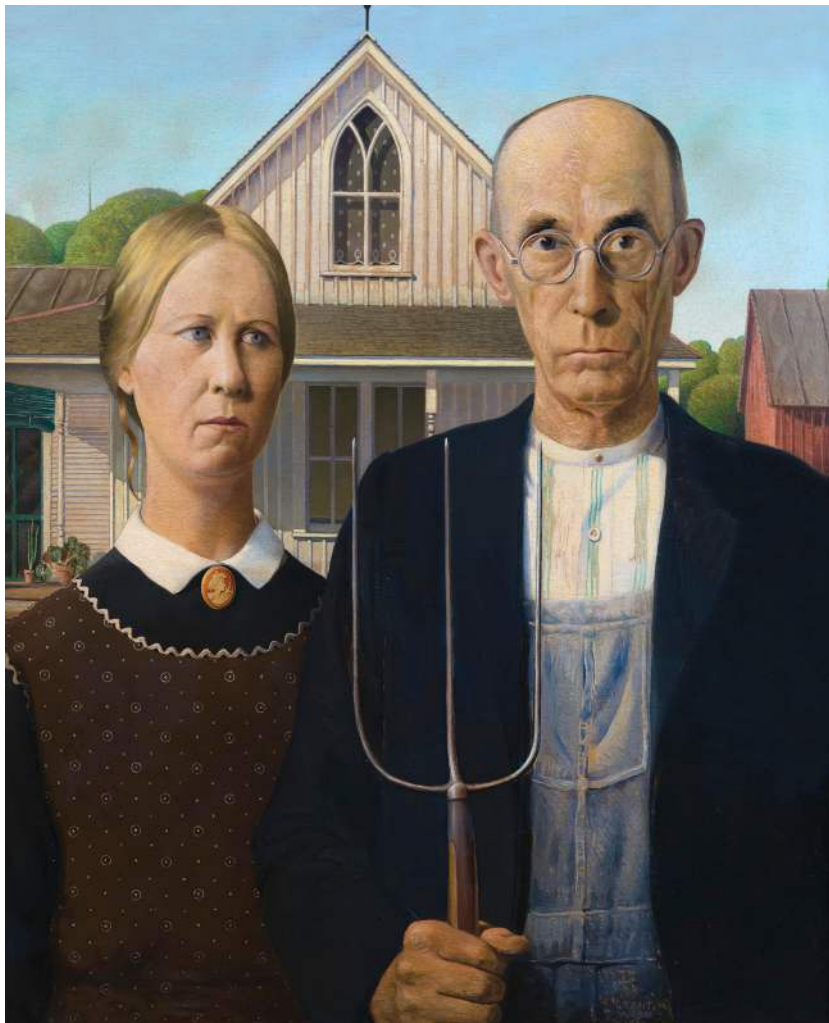
A painting from 1930 showing a farmer and his daughter.