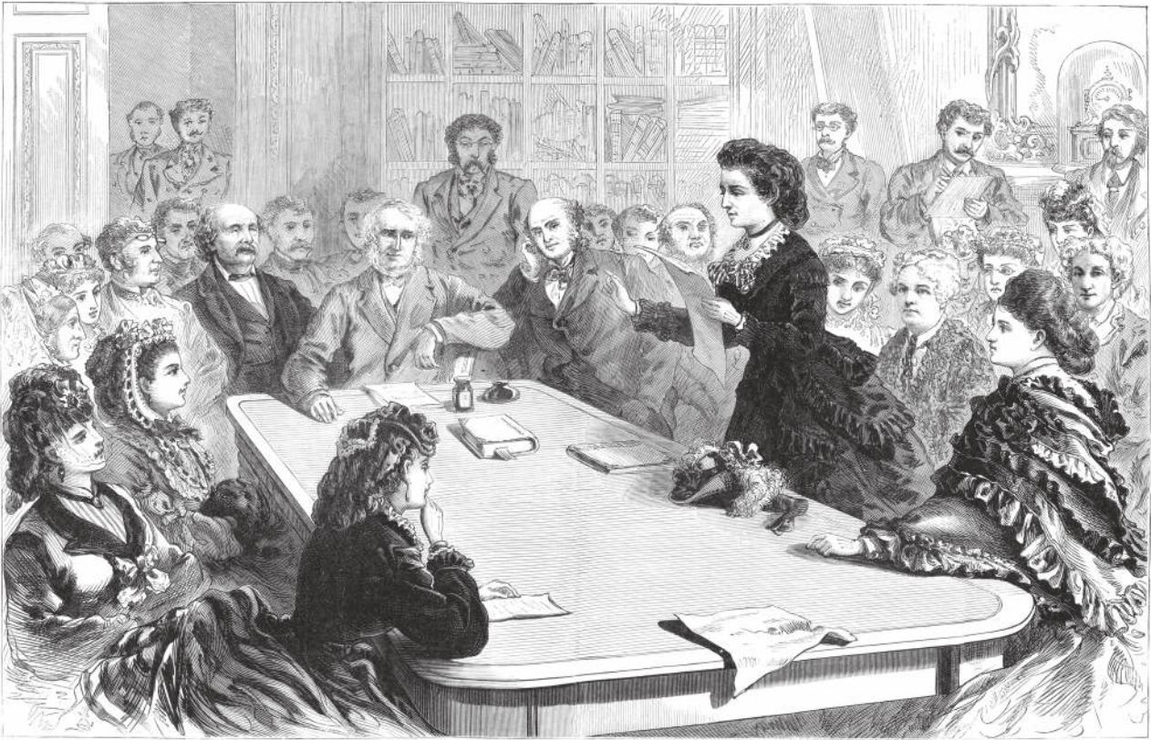
Female suffrage activists presenting their arguments in favor of women having the vote to the Judiciary Committee of the House of Representatives in January 1871.