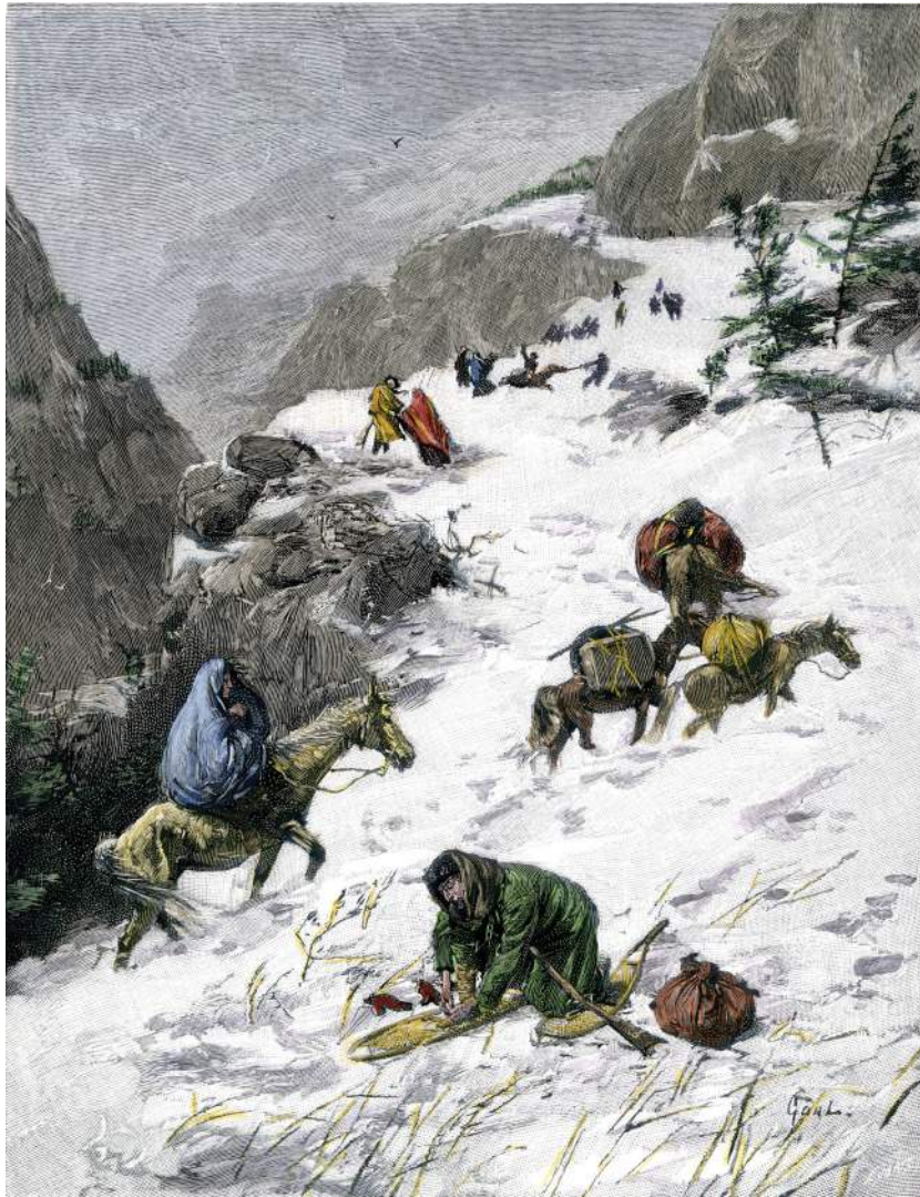
A drawing showing the dangers of crossing the Sierra Nevada mountains, 1891.