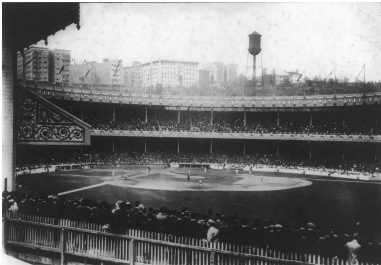
A baseball game being played in a stadium in New York in the early 1920s.