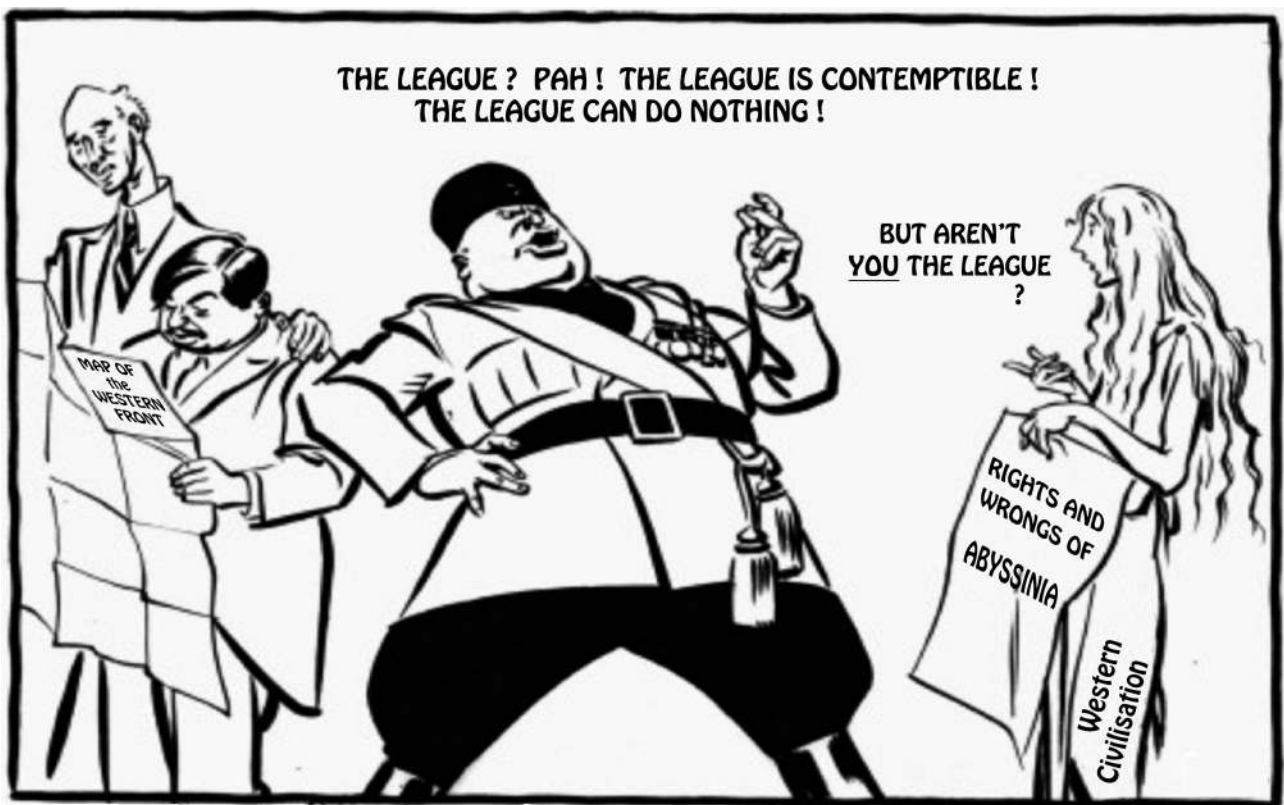
A British cartoon published in February 1935.