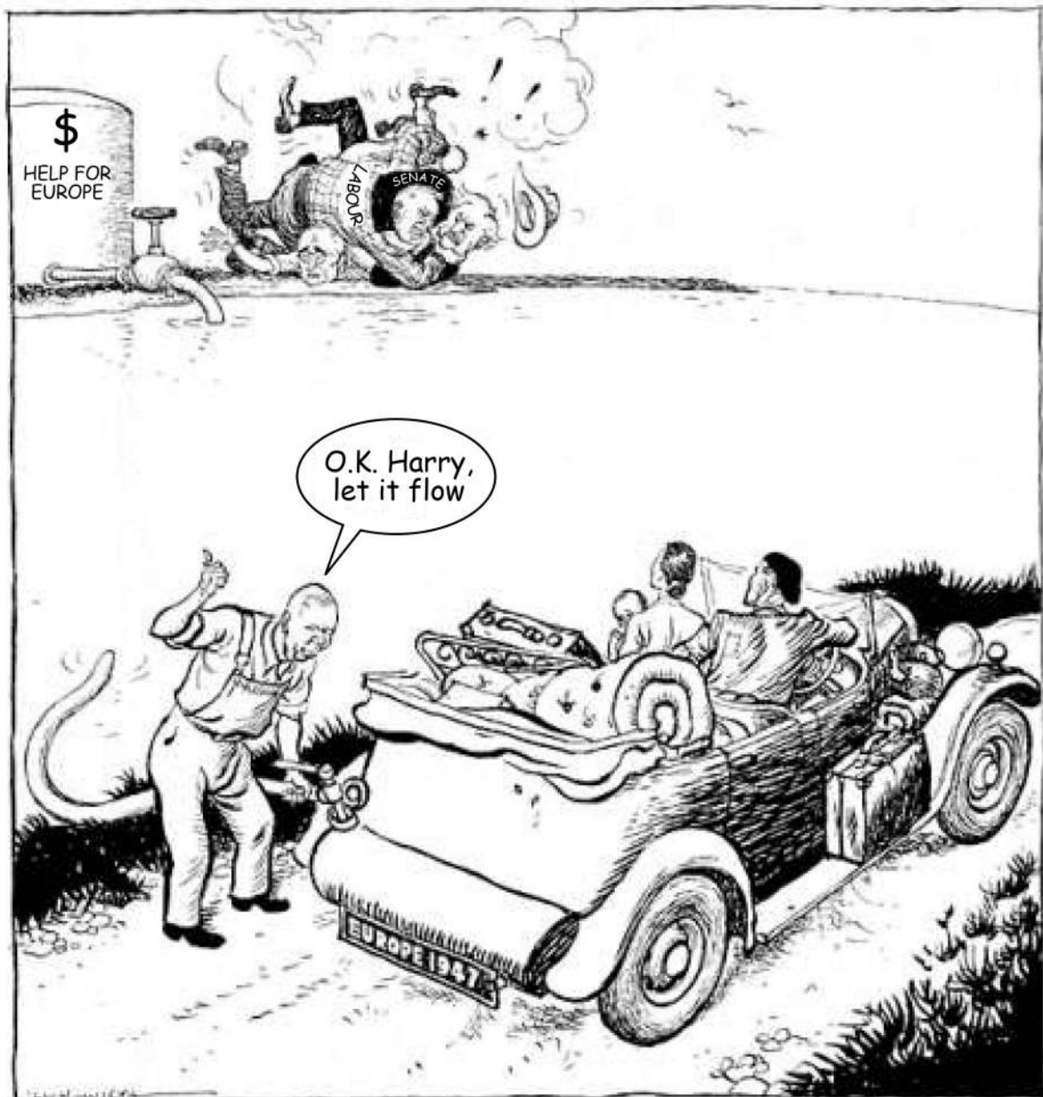
A cartoon published in Britain, June 1947. Marshall is speaking to Truman, who is held down by his opponents.