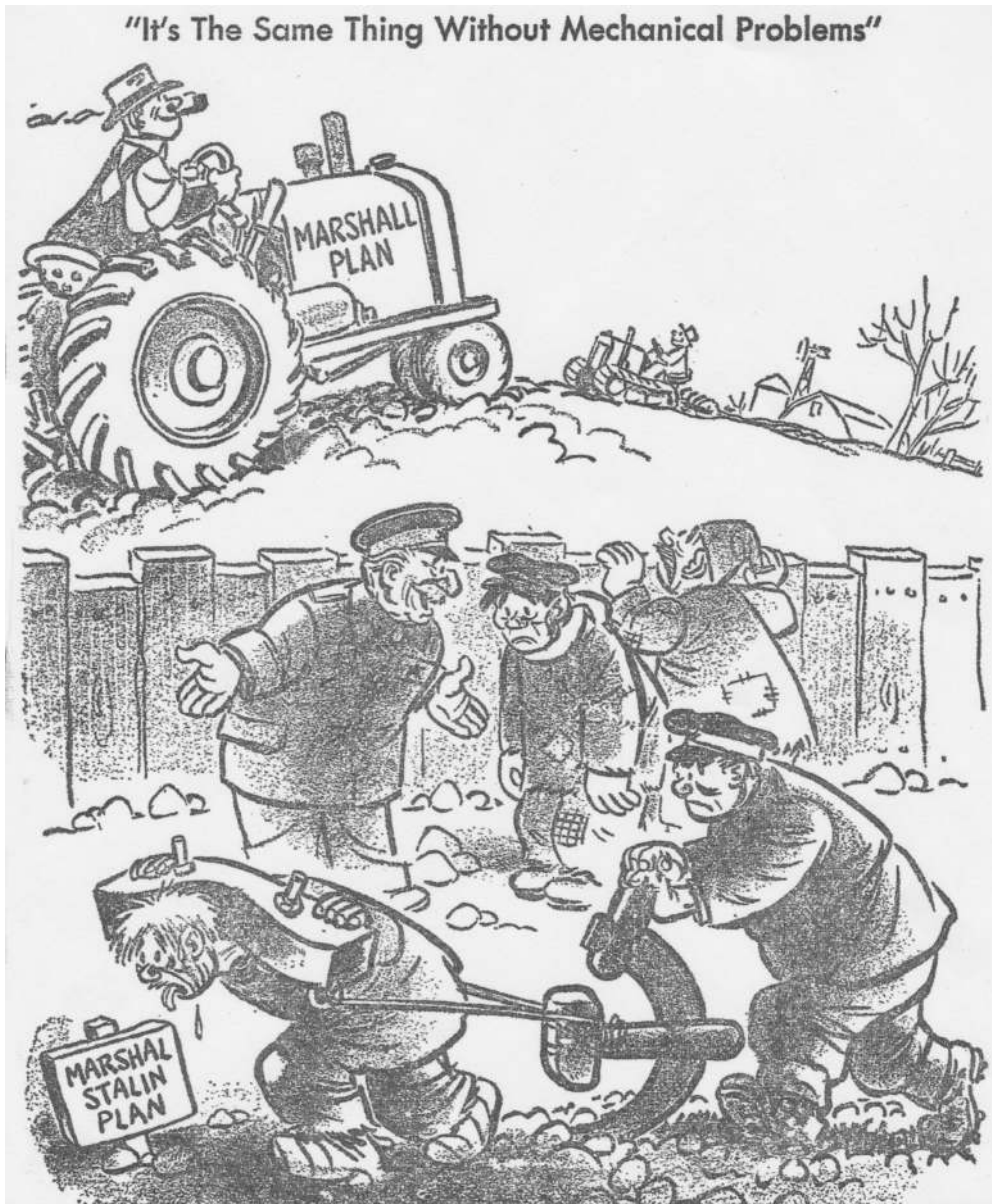
A cartoon published in the USA, January 1949.