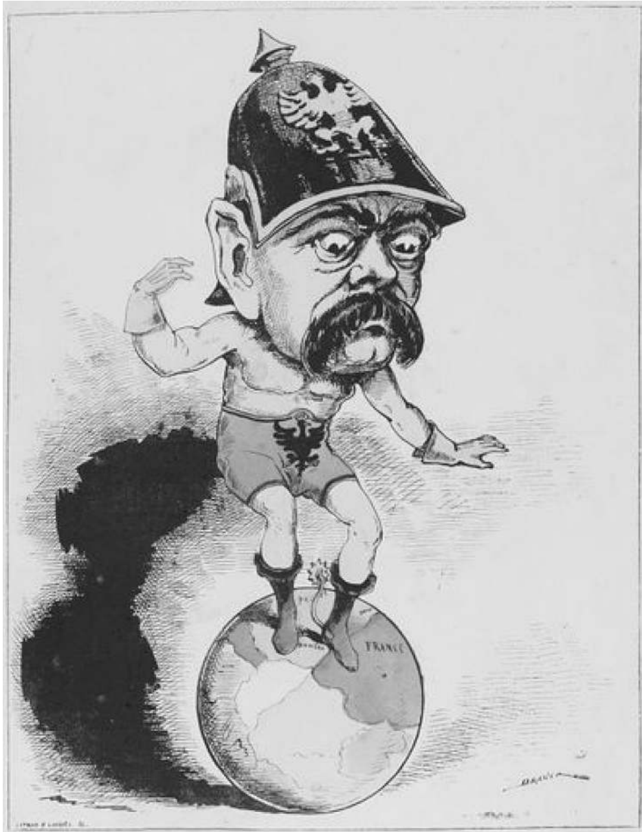
A cartoon published in France, 1870. The title of the cartoon is 'The Man on the Ball'. Bismarck's left foot is on France.