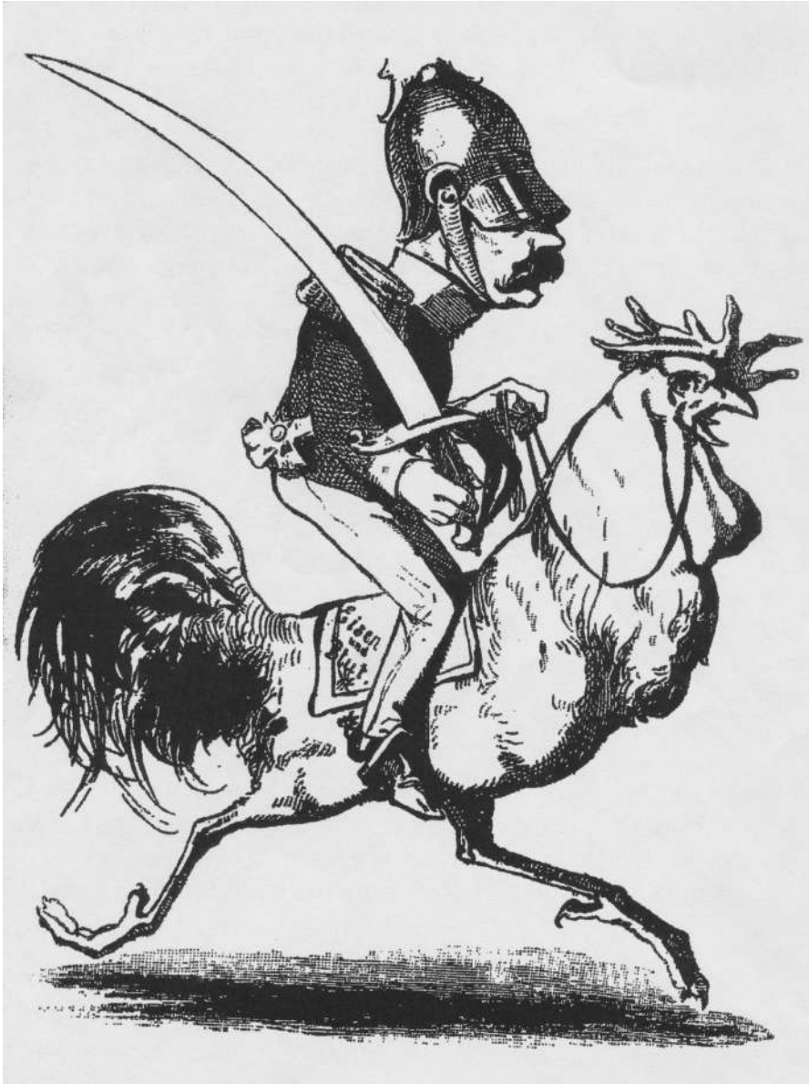
A cartoon, entitled 'The New Blücher', published in the free city of Frankfurt, 1863. Frankfurt supported Austria in the war of 1866. The cartoon shows Bismarck riding a cockerel which represents France. Blücher led the Prussian army in the defeat of Napoleon I at Waterloo in 1815. On the saddle is written 'Iron and Blood'.