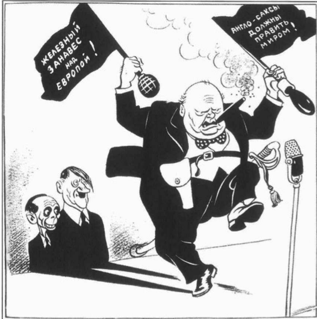
A cartoon entitled 'Churchill and His Predecessors' published in a Soviet magazine, March 1946. The flags read 'Iron Curtain Over Europe' and 'The English Should Rule the World.'