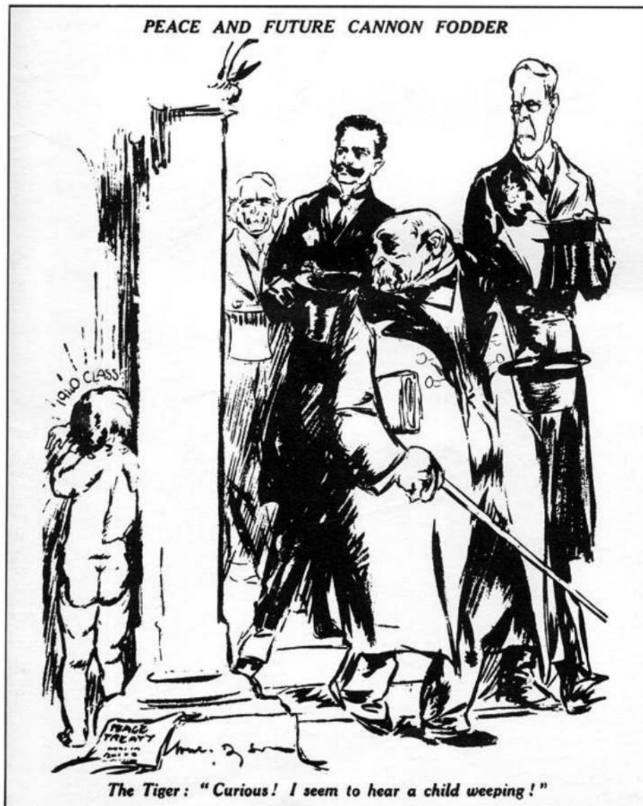
A cartoon published in a British newspaper, May 1919. 'The Tiger' refers to Clemenceau.