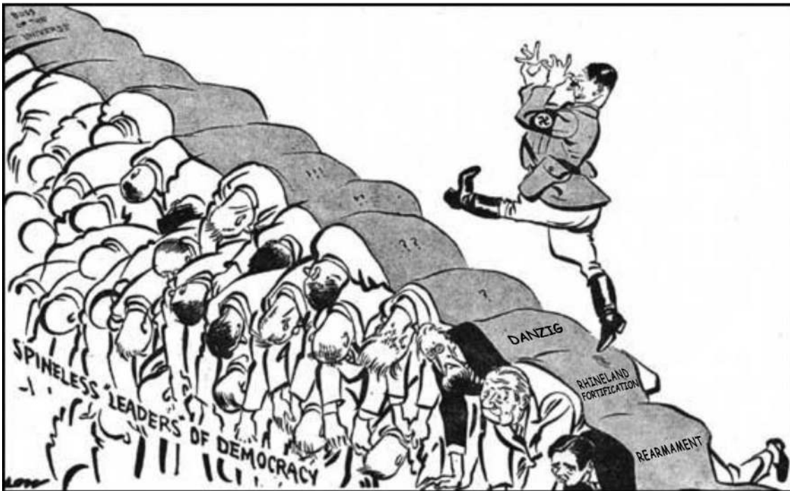
A cartoon, entitled 'Stepping Stones to Glory', published in a British newspaper, July 1936.