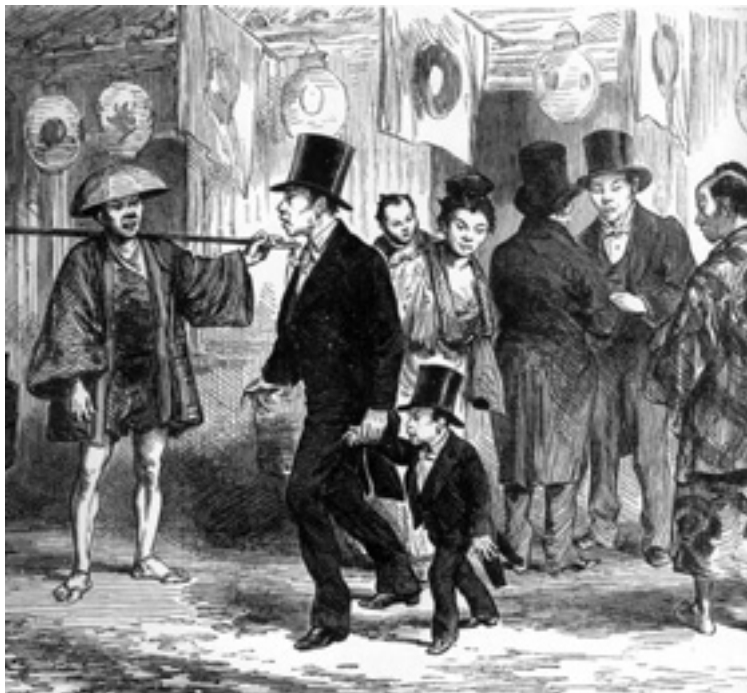
A cartoon published in a British magazine in the second half of the nineteenth century. It shows some Japanese wearing western fashions.