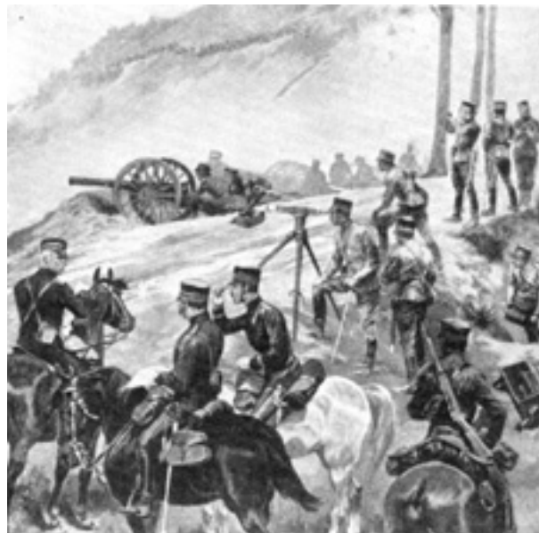
A drawing of Japanese soldiers in 1904.