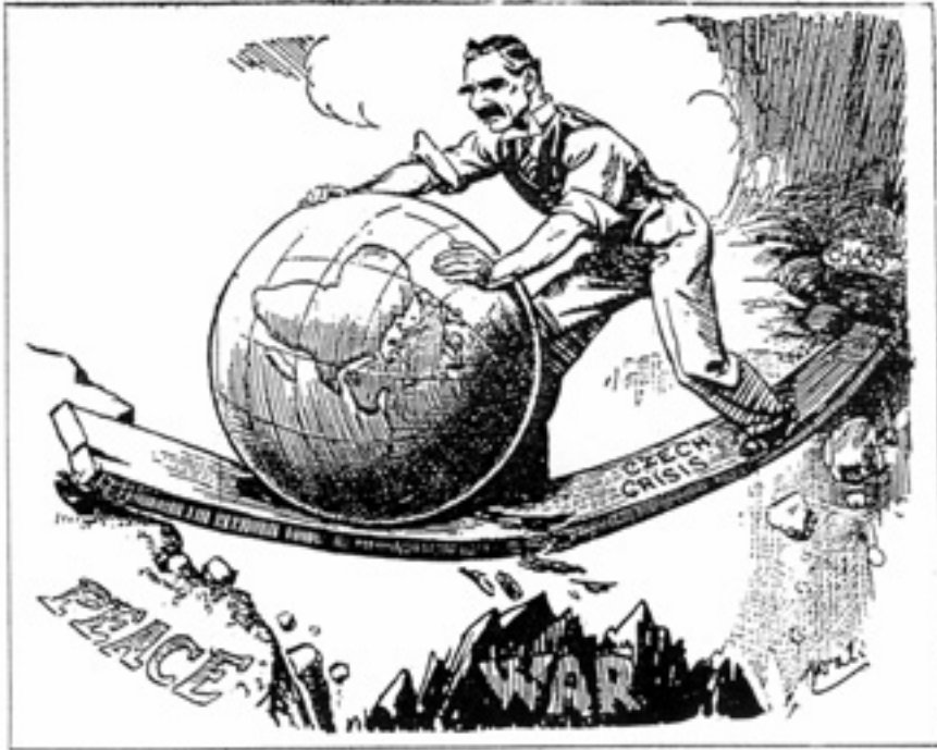
A cartoon published in a British newspaper on 25 September 1938.