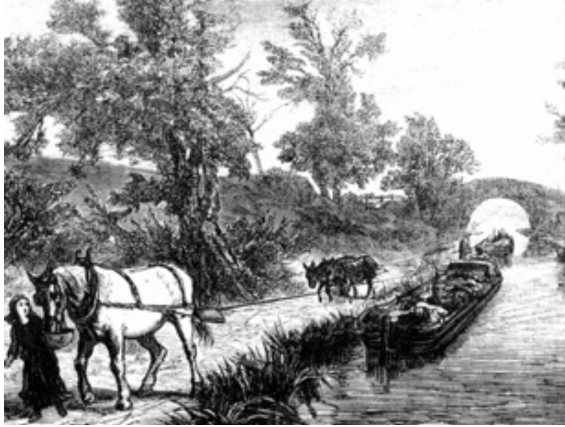
An early nineteenth-century drawing of canal barges.

22 Study the picture, and then answer the questions which follow.