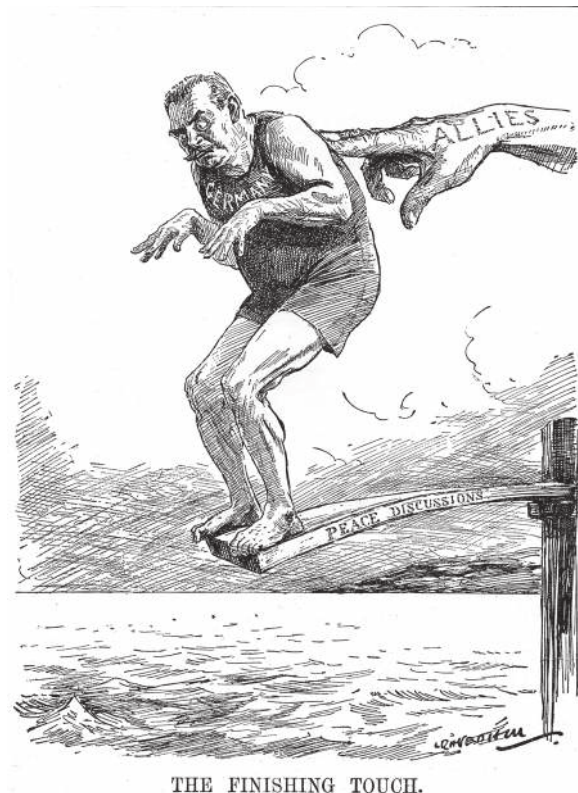
THE FINISHING TOUCH.

A cartoon published in a British magazine, June 1919. The words on the plank say 'Peace discussions'.