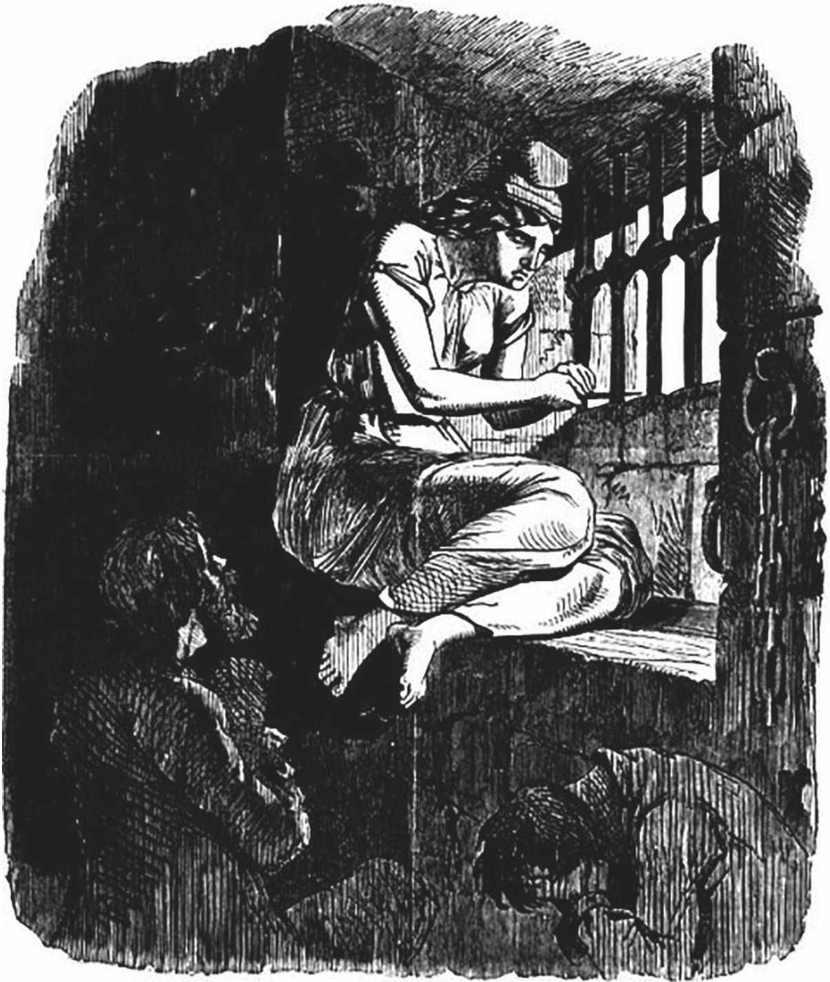
An illustration published in a British magazine, September 1856. It is entitled 'Liberty files the Austrian Bars of Italy.' 'Files' means cuts away.