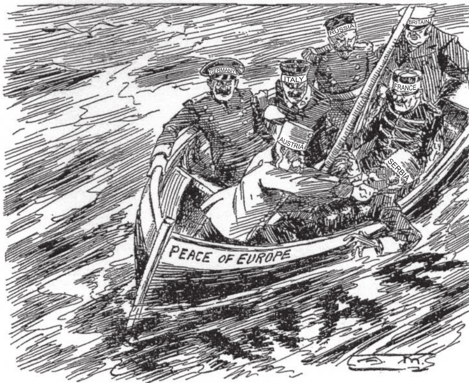
A cartoon published in Britain, 1 August 1914.