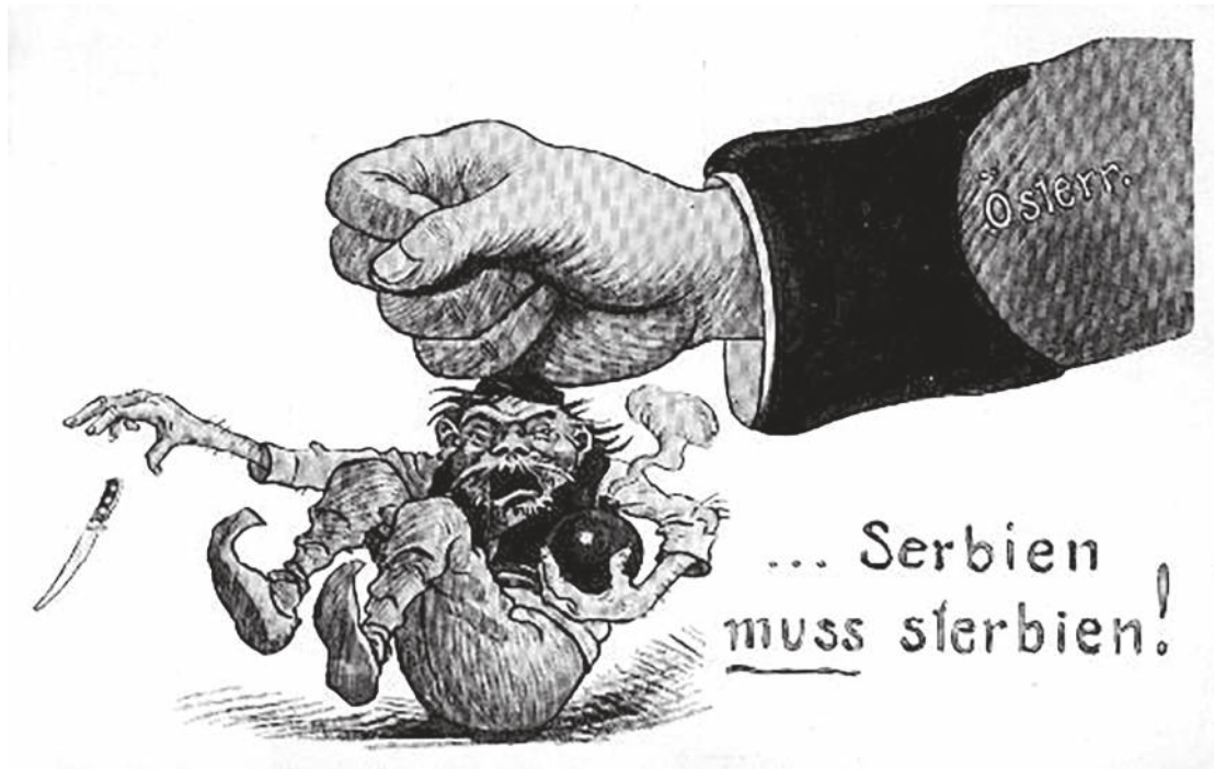
An Austrian cartoon published shortly after the assassination of Archduke Ferdinand. The words say 'Serbia must die!' 'Osterr' means Austria.