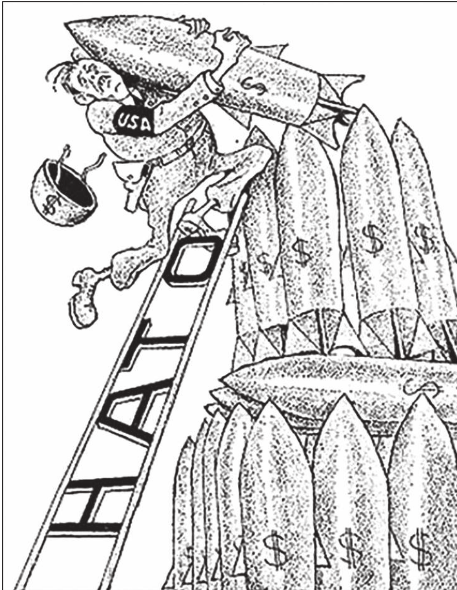
A cartoon published in the Soviet Union in 1949. The word on the ladder is 'NATO'.