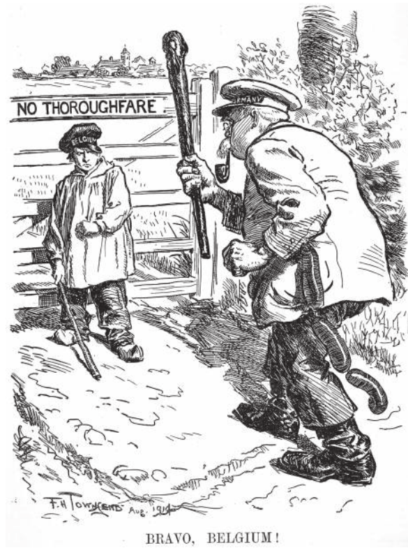
A cartoon published in Britain, 12 August 1914.