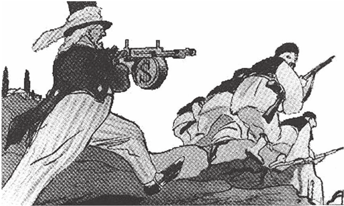
A cartoon published in the Soviet Union in 1947. It shows American aid during the Greek civil war.