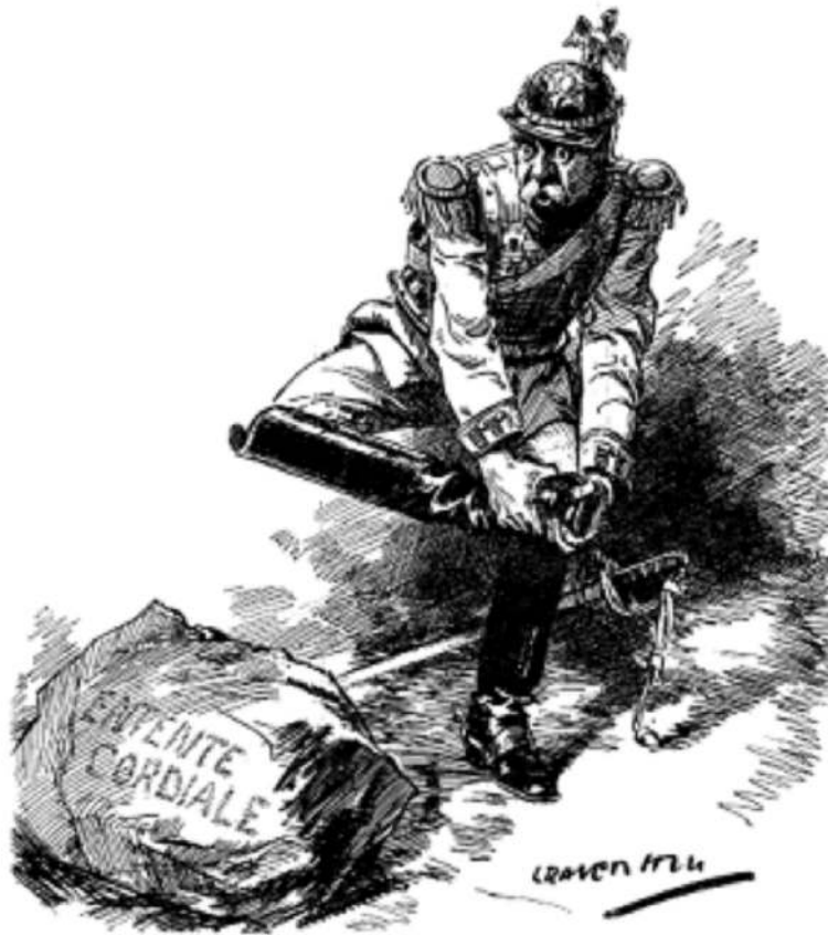
A British cartoon, entitled 'Solid', published in August 1911. The Kaiser is saying 'Donnerwetter! It's rock. I thought it was going to be paper.'