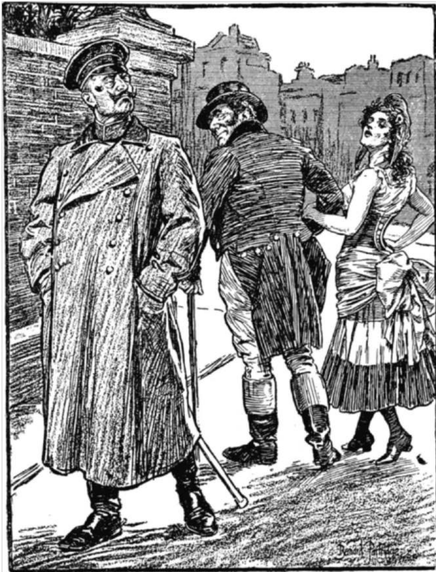
A cartoon published in Britain in 1904. Britain is shown with France.