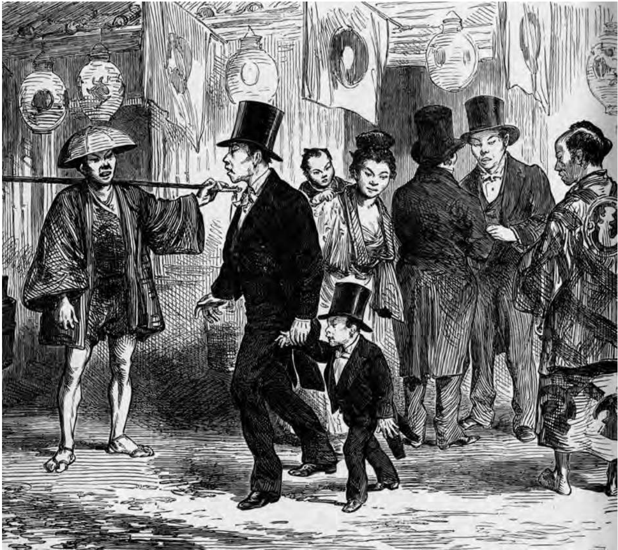
A cartoon of a street scene in Japan towards the end of the nineteenth century. It was published in a British magazine at the time.