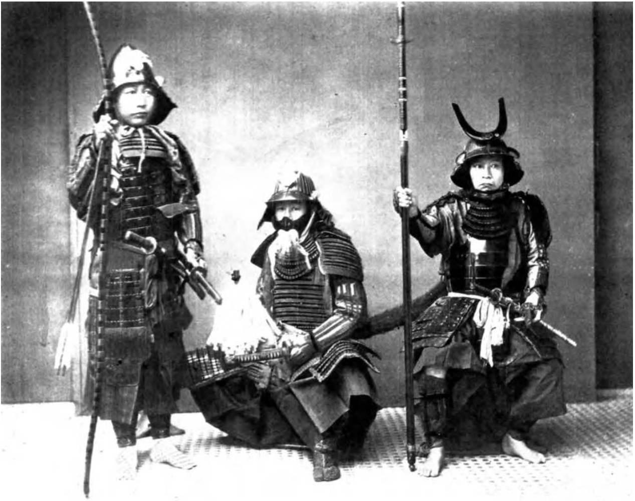
A photograph of Samurai in the 1890s.