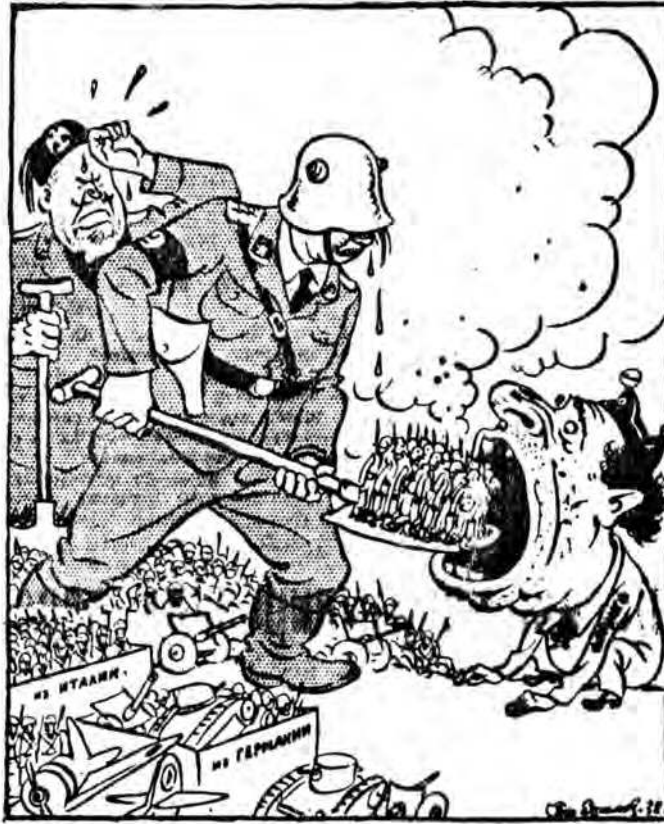
Рис. Бор. Ефимова.