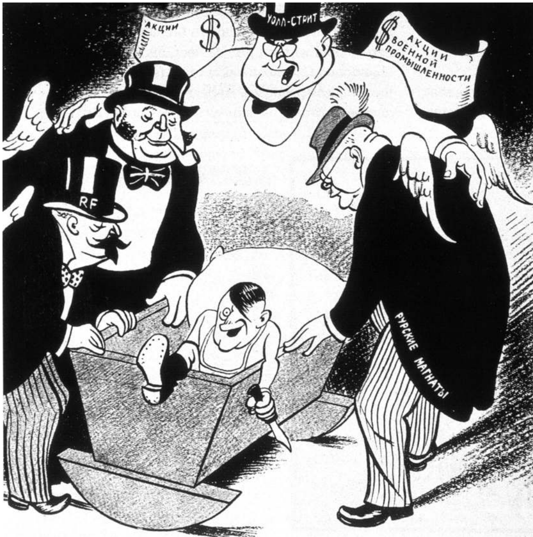
A Soviet cartoon published in 1936. It shows the western countries with Hitler.