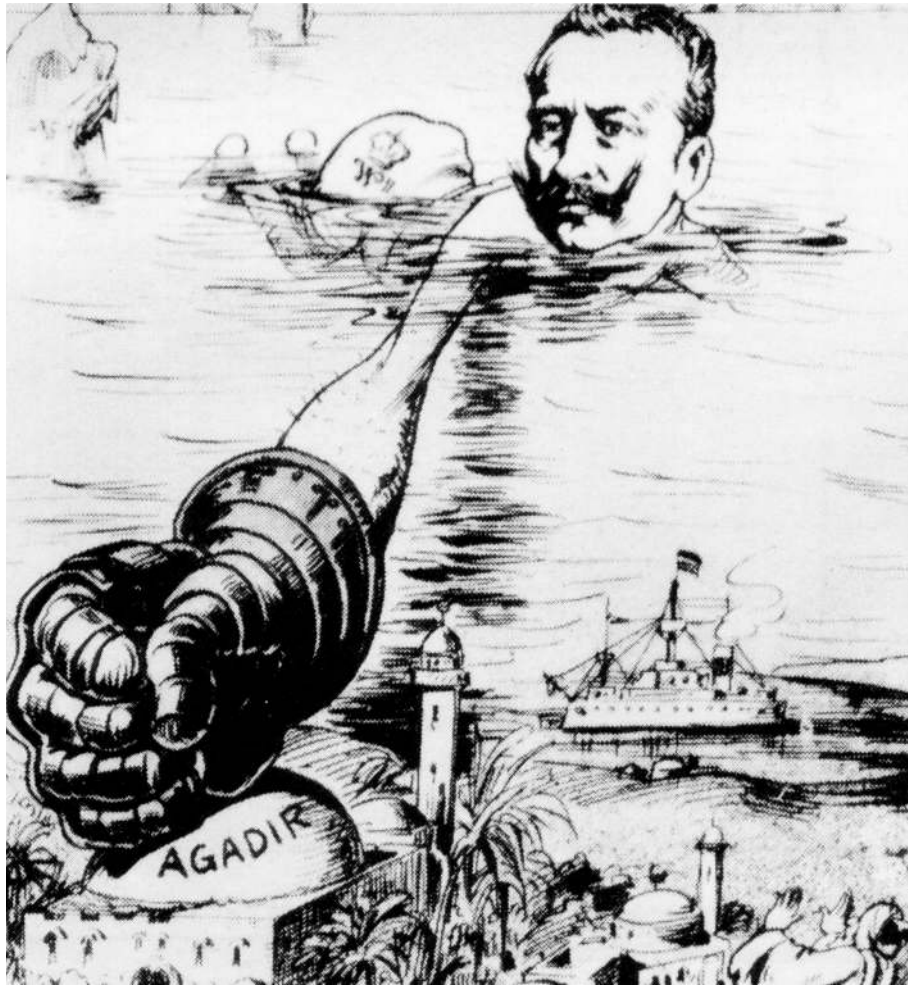
A cartoon about the Second Moroccan Crisis, published in 1911.