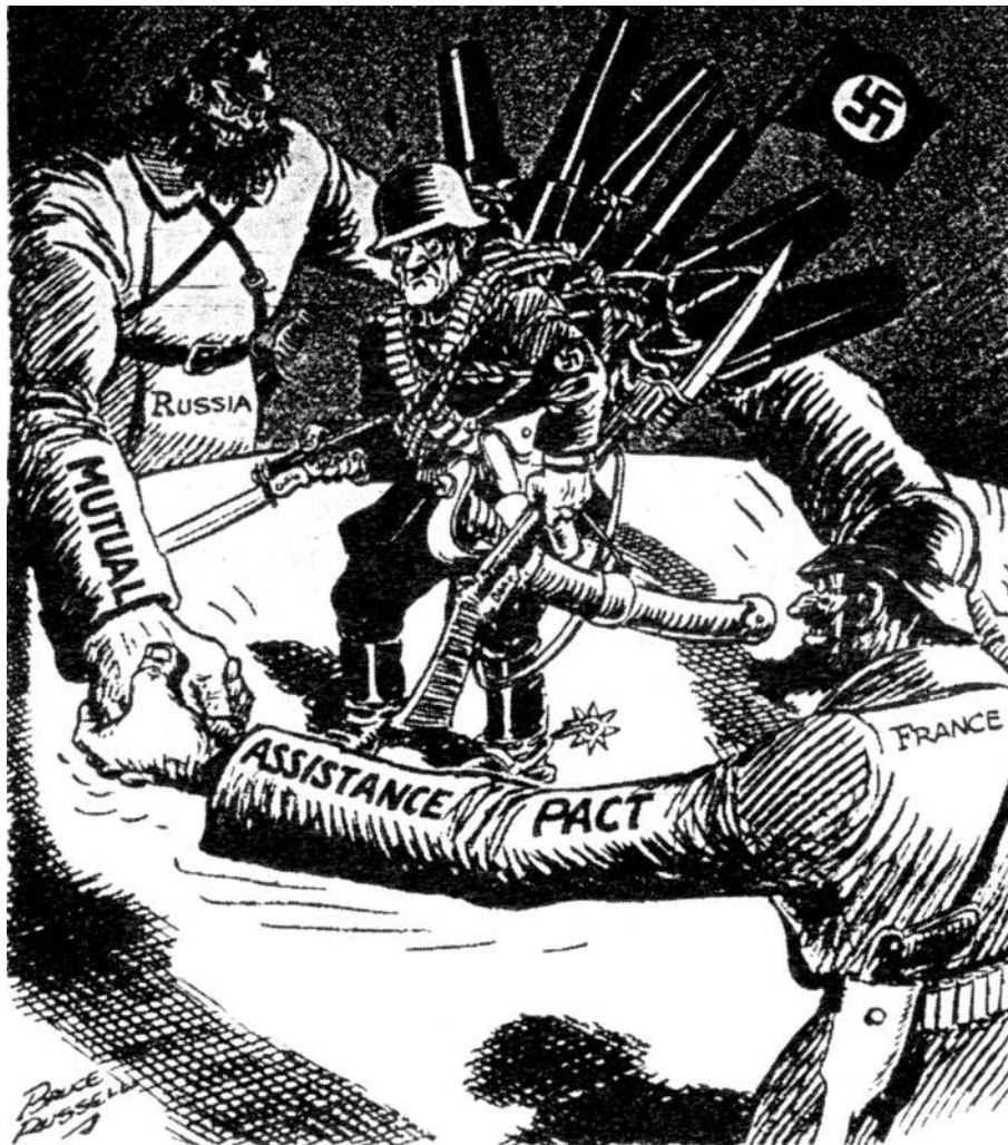
An American cartoon published in March 1936.