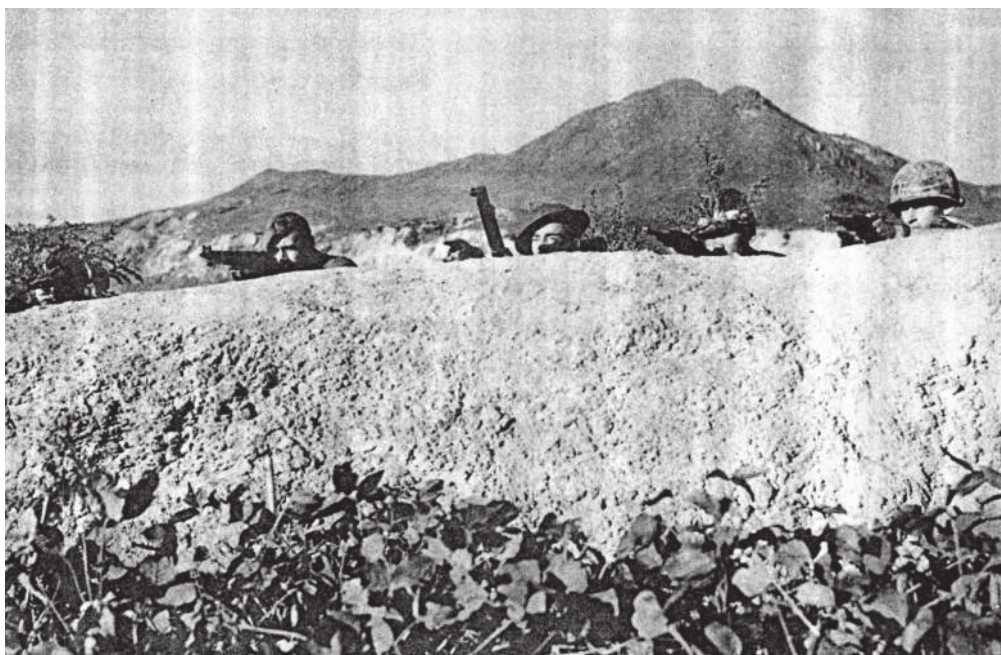
A photograph of UN soldiers in the Korean War. The soldiers include an American, an Australian, an Englishman, and two South Koreans.