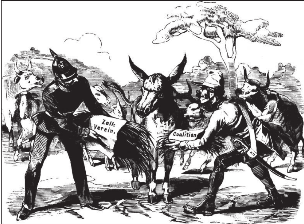
A cartoon from a German magazine published in 1852. The man on the left represents Prussia while the man on the right represents Austria. The animals represent those German states that did not belong to the Zollverein.