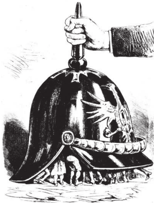
A cartoon published shortly after the Austro-Prussian War in 1866. The helmet represents Prussia while the people represent Germany.