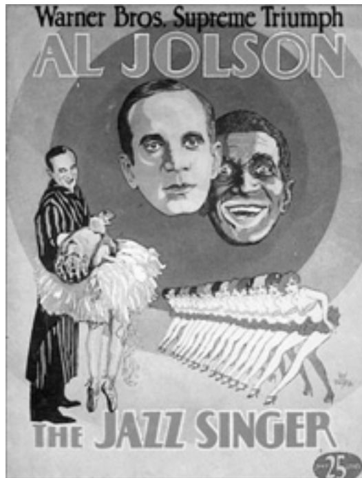
Poster for the film 'The Jazz Singer', the first 'talkie' film.

13 Study the picture and then answer the questions which follow.