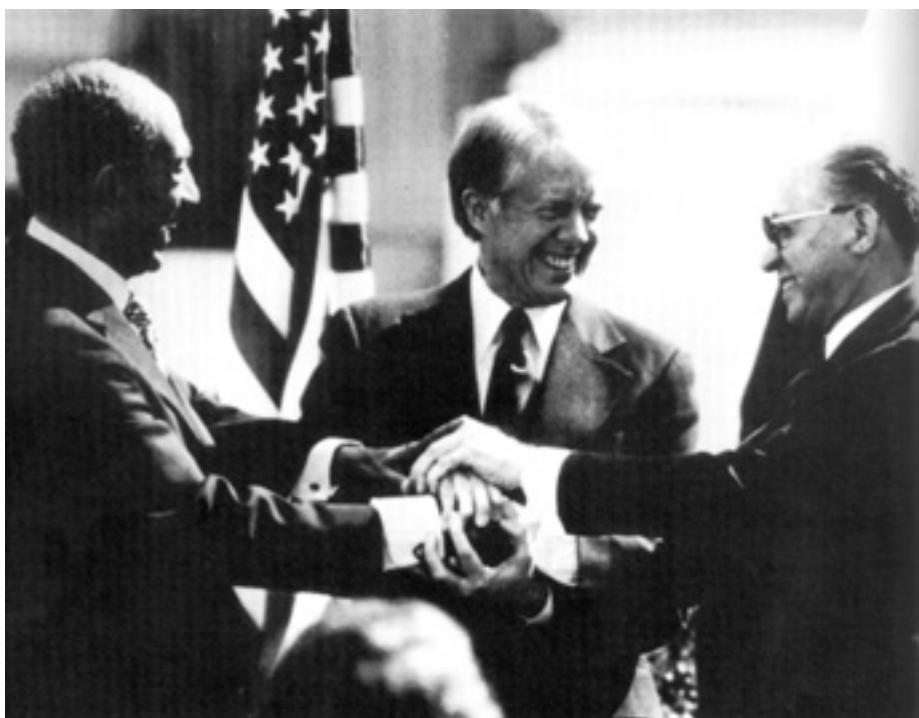
Begin, Sadat and US President Carter celebrate the peace treaty between Israel and Egypt, Washington DC, 16 March 1979.

21 Study the photograph and then answer the questions which follow.