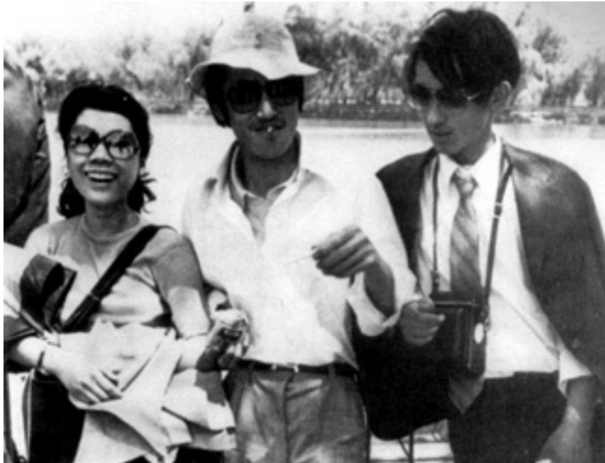
Photograph of young Chinese on the streets of Beijing in the 1980s.

16 Study the photograph and then answer the questions which follow.