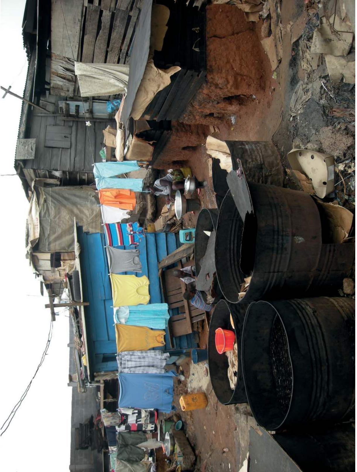
Fig. 2.2 for Question 2