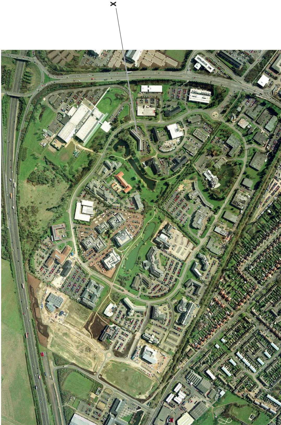
Fig. 1.1 for Question 1 High technology industrial area in 2006