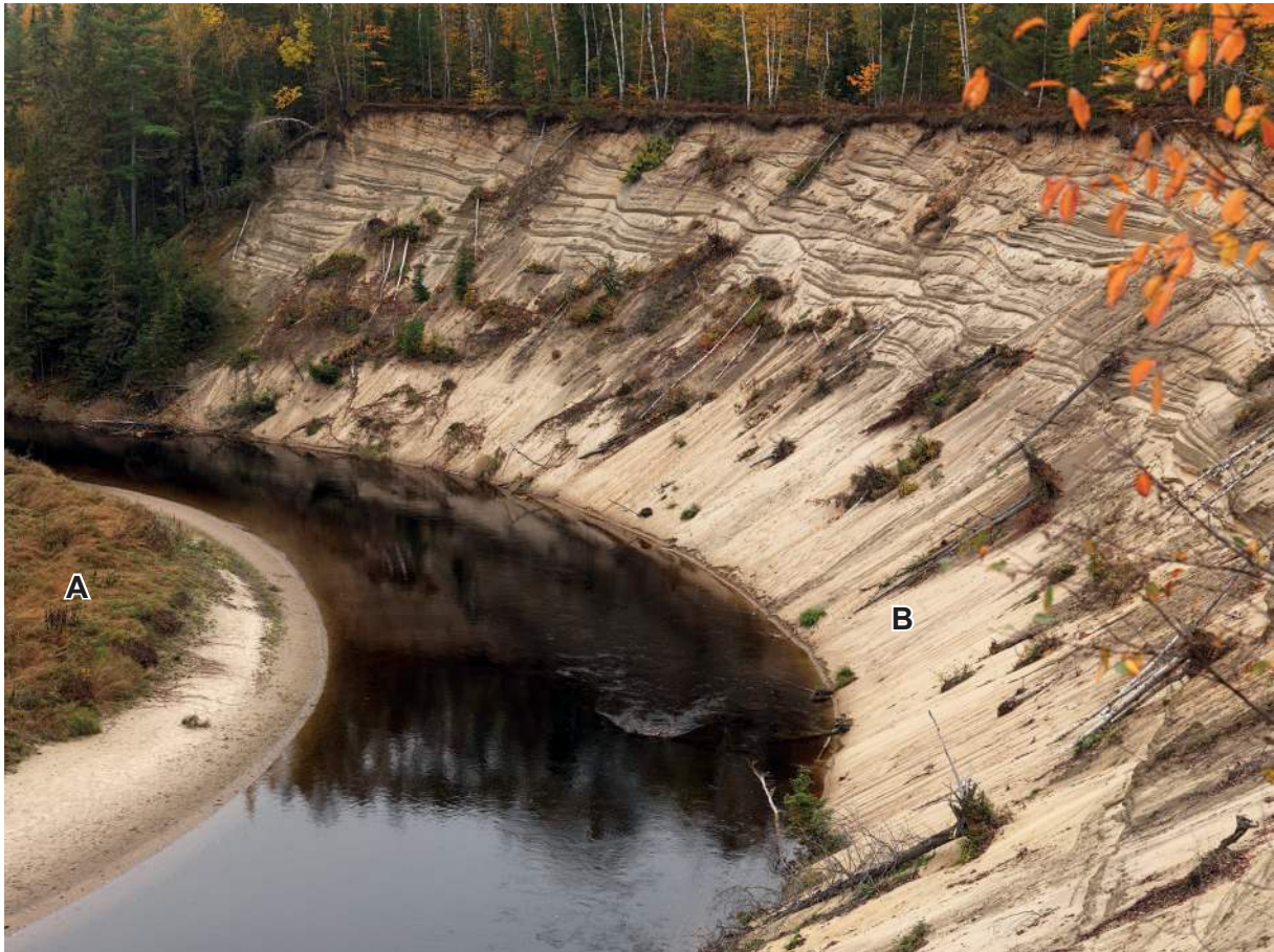
Fig. 5.1 for Question 5