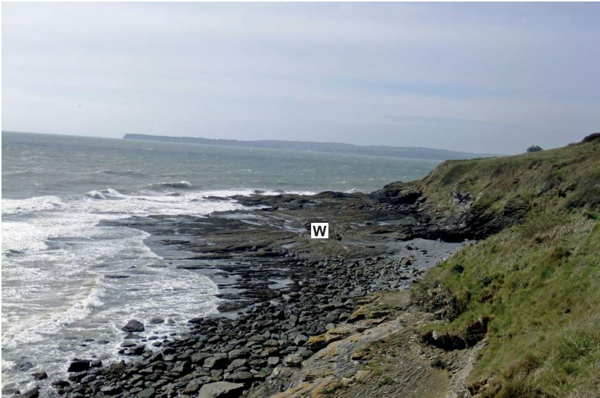
Figs. 3.1 and 3.2 for Question 3