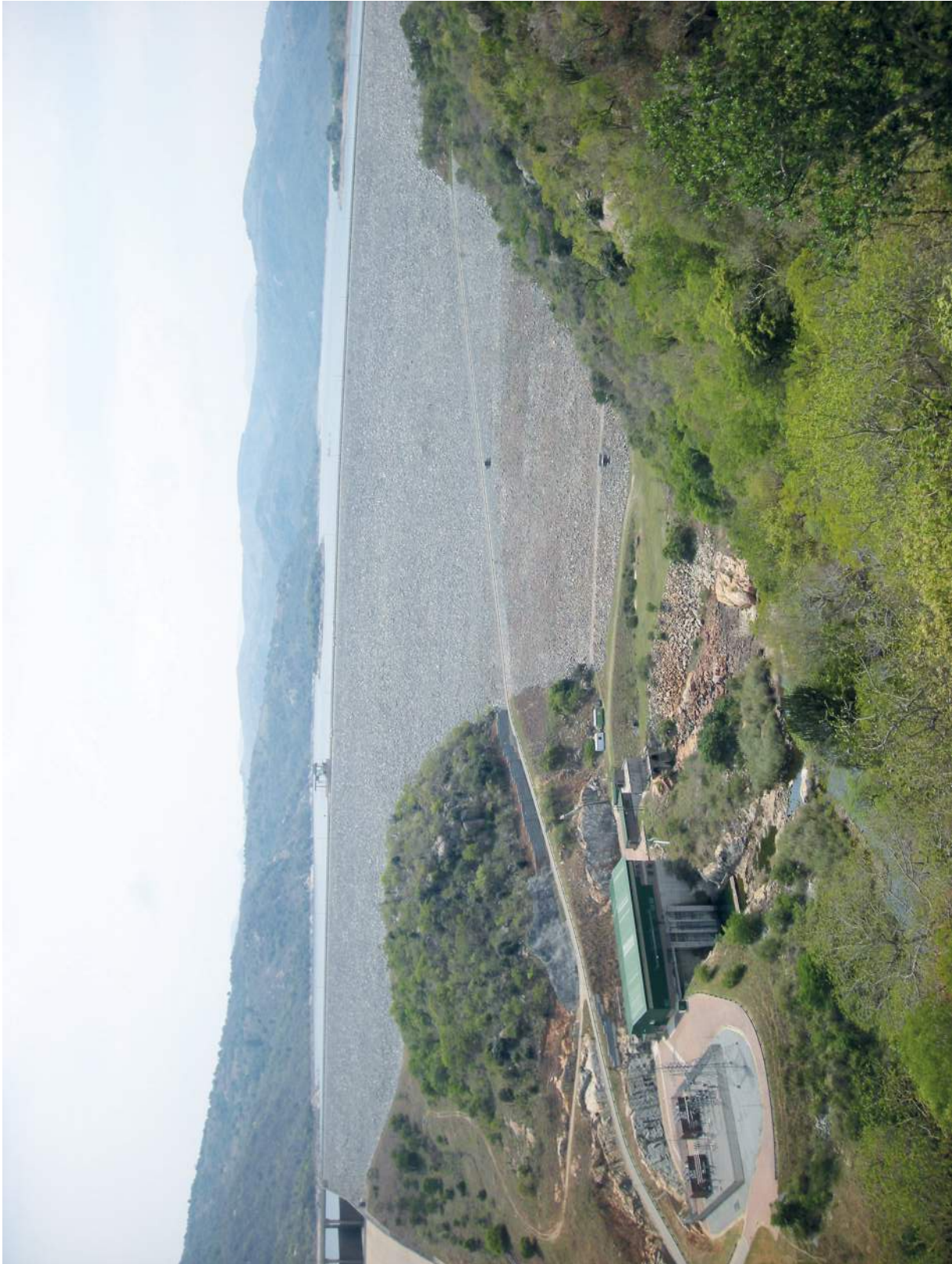
Photograph A for Question 5