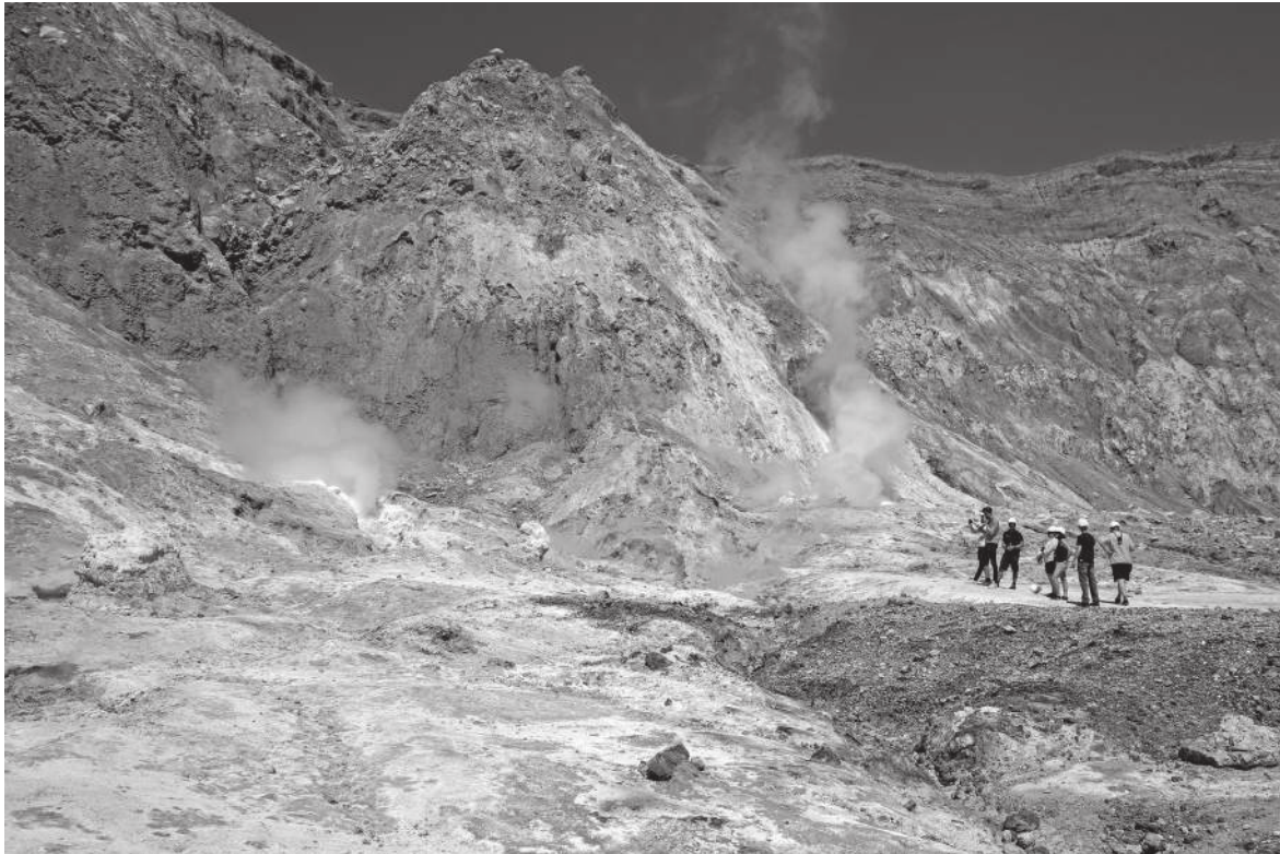
Cruise based excursion on White Island, New Zealand.

Despite this, a number of tourists were injured while on an excursion with their local guide when a volcano erupted.