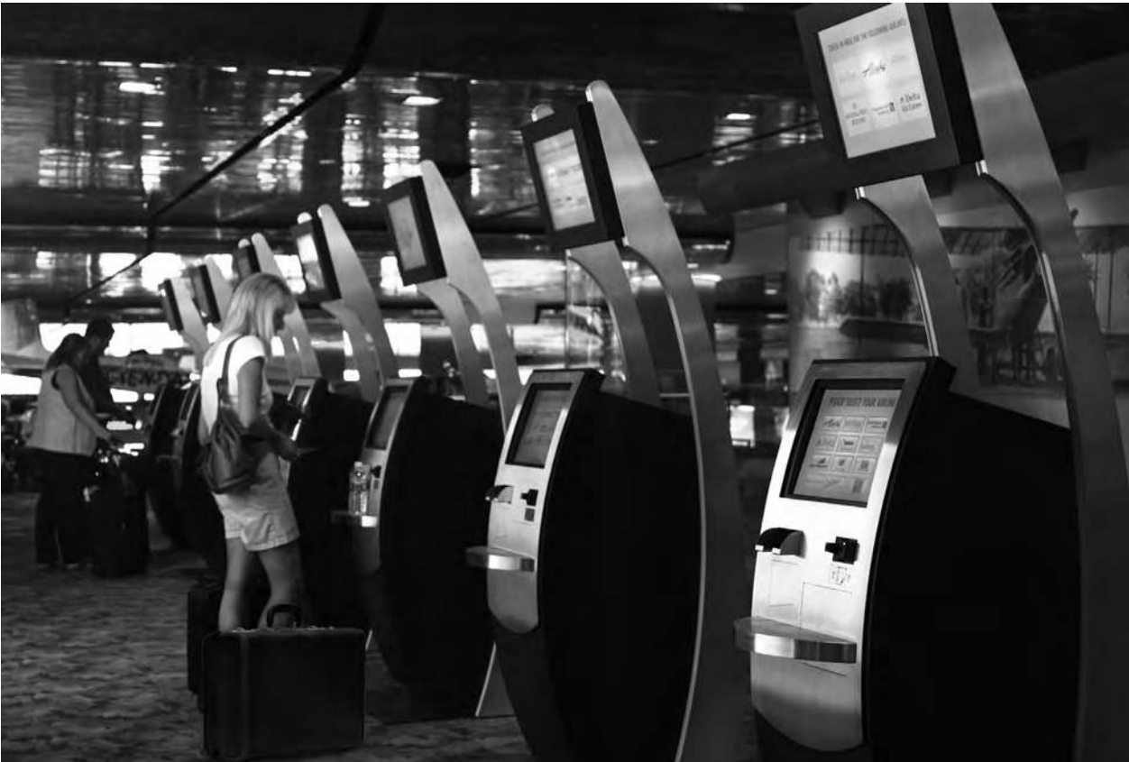
E-Check-in facilities at Suvarnabhumi airport, Bangkok

The new airport offers a variety of facilities, including Thai food shops, Duty Free shops, Children's play areas, Internet cafés, large waiting lounges and VIP lounges.