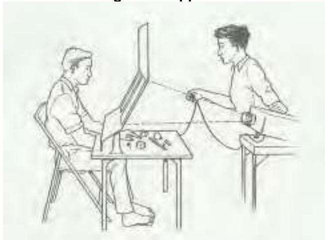
Diagram of apparatus

1 mark for each piece of equipment: one eye covered; gaze centred on fixation point; stimuli presented on 35mm transparencies for 1/10th of a second or less. Objects.