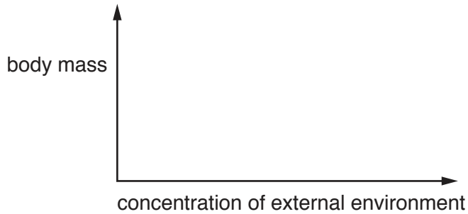
Fig. 3.2 [1]

(iii) On Fig. 3.2, sketch a line to show how the body mass of a mussel would change as the concentration of the external environment changes.