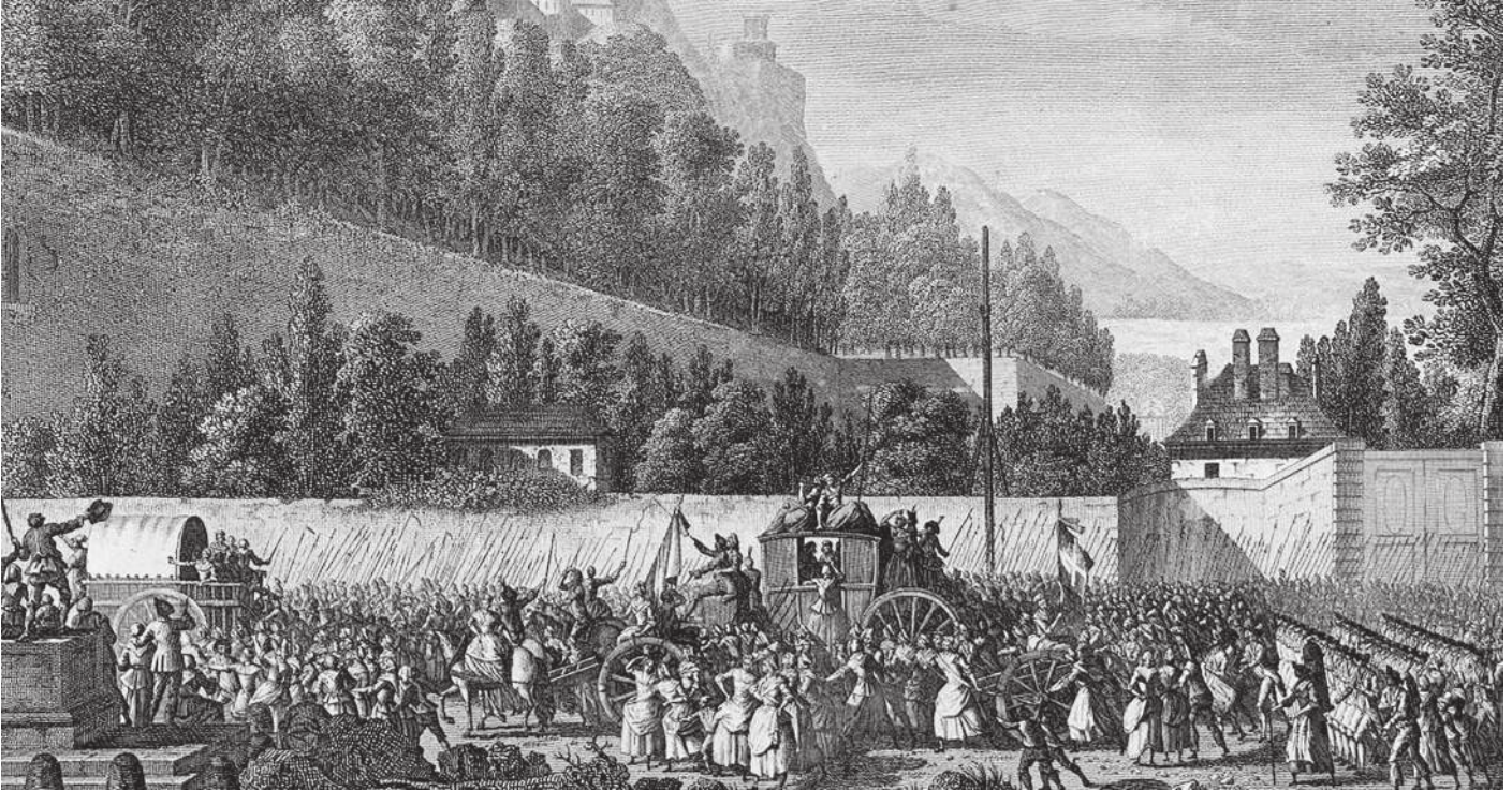
A contemporary illustration of the return of the King to Paris on 6 October 1789.