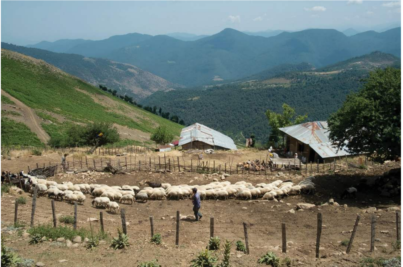
A pastoral farm in Iran, an MIC in the Middle East